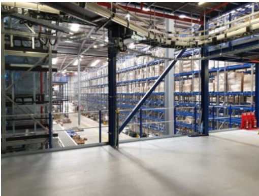
Inside the 670,000 ft 2 highly mechanised facility offering retail store fulfilment, b2b and b2c shipment capability

Three years later and Pets at Home's new head quarters and 670,000 ft 2 national fulfilment centre was opened on Tuesday 25th April 2023. Already employing 300 staff in the operation and a further 120 staff in the head office and bringing on new members of staff at the rate of 40 per week, their operation is impressive.