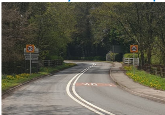
New 40mph buffer zone added to Eccleshall on both A519 and A5013

A number of road safety schemes have been implemented across the wider area to try and address community concerns about the speed of traffic in their local areas and road safety.