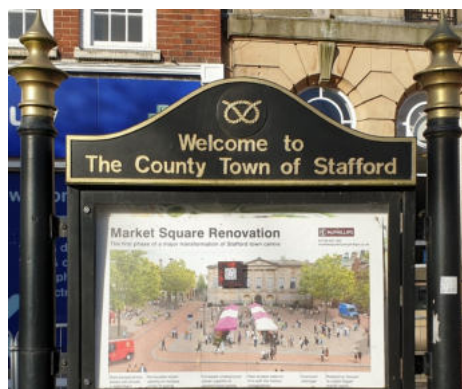
The vision for the new Market Square

place to bring back some more empty buildings and give them a new lease of life. Although these discussions can be somewhat drawn out with landlord price aspirations often out of this world and simply unaffordable for the public purse.