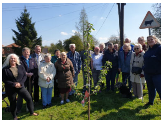
Residents of the Highfields in Croxton turned out en masse for the commemorative tree planting

The tree planted was a flowering apple, which will not only provide much beauty in time, but will also provide a tasty treat in the Autumn for anyone lucky enough to be passing by.