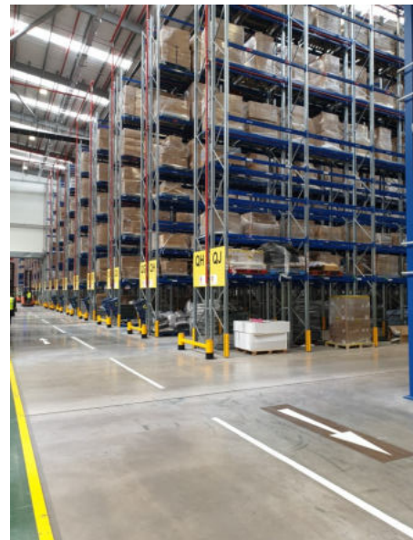
Compact high bay storage for some of Pets at Home's 11,000 lines with picking by individual line, case and pallet to suit the specific customer segment

Three years later and Pets at Home's new head quarters and 670,000 ft 2 national fulfilment centre was opened on Tuesday 25th April 2023. Already employing 300 staff in the operation and a further 120 staff in the head office and bringing on new members of staff at the rate of 40 per week, their operation is impressive.