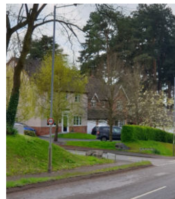
New 40mph speed limit for Cold Meece and 50mph up to Swynnerton village, along Swynnerton Road

It is planned to leave the new speed limit areas for the first six months, to allow driver behaviour to change and then invite the Speed Camera Van to come and visit some of those areas to help encourage the adherence to the new limits.