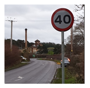
New 40mph Speed Limit at Hatton round the waterworks and cottages