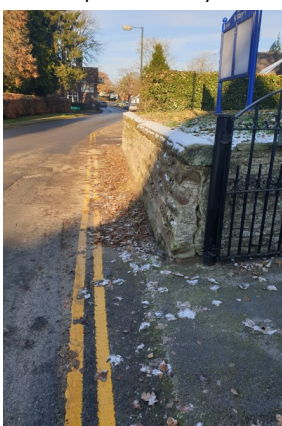
No parking—Double Yellow Lines round bends in Swynnerton

Therefore it is pleasing to see the delivery of a large number of schemes that have been championed by local communities this quarter, including:-