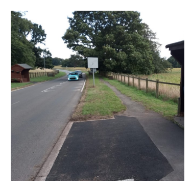
Access improvements for bus users in Swynnerton

Many of these schemes can cost between £4.5—£7.5k to deliver with multiple rounds of consultation and the need to get the process properly executed so that the restrictions are legally enforceable. Hence the sheer volume of time that they take to deliver.