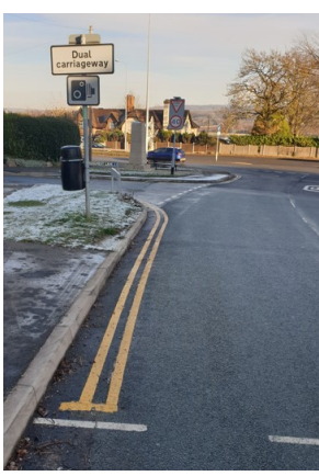
No parking round the junction and Tittensor War Memorial on Winghouse Lane