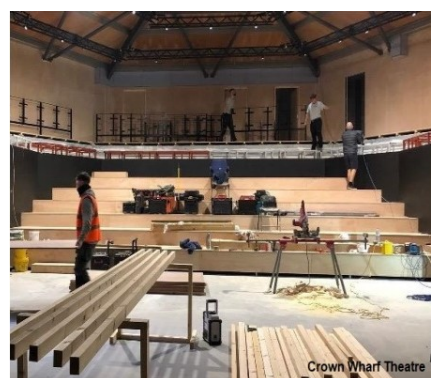
Stone's Crown Wharf Theatre—one of a dozen projects to receive funding from the Borough Council to support their ambitious plans for a new community space for over 200 people, which will open in 2023

Additional moneys have been set aside to support and boost the rural economy, given that so much of the Borough is