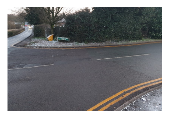
No parking—Double Yellow Lines at Ferndown Drive South