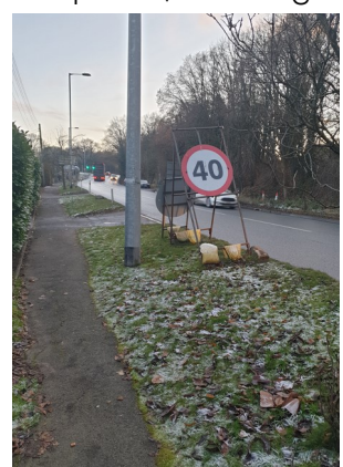
New 40mph Speed Limit at Newcastle Road, Hanchurch