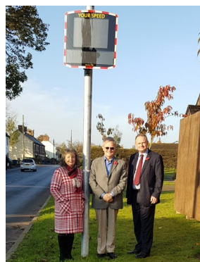
At the installation of the Eccleshall Speed Indication Device, with Eccleshall Parish Council –October 2019

Community Speed Watch groups have a role to play in this, as do the fixed roadside Speed Indication Devices (S.I.D.) that have been popping up all over the local area.