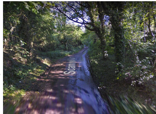
Scammell Lane, Chebsey improvements undertaken in December 2020

their staff to remove the soil, lay proper drainage pipes and stone up the area, so that it could allow local residents a convenient spot to pull in and let other traffic to pass safely, without risking becoming trapped wheel-deep in mud.