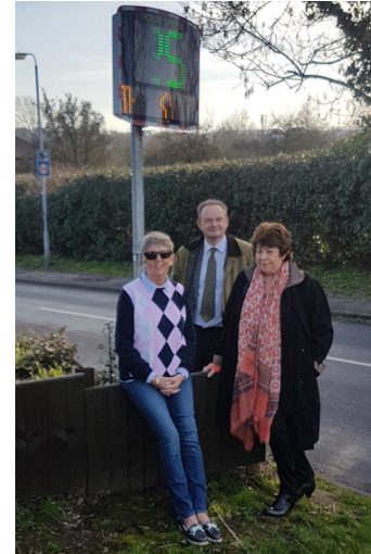
At the installation of the Northwood Lane Speed Indication Device, with Swynnerton Parish Council—February 2019

These were driven by Creswell Parish Council and installed after lockdown in October 2020, thanks to the Parish Councillors perseverance and hard work over many years.