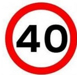
New Buffer Zones are being proposed for Yarnfield, in partnership support from Yarnfield Parish Council

Just such a scheme has been proposed for outside of Yarnfield village, subject to consultation, through working with the new Yarnfield Parish Council and if successful could be implemented as early as late Spring or Summer 2021.