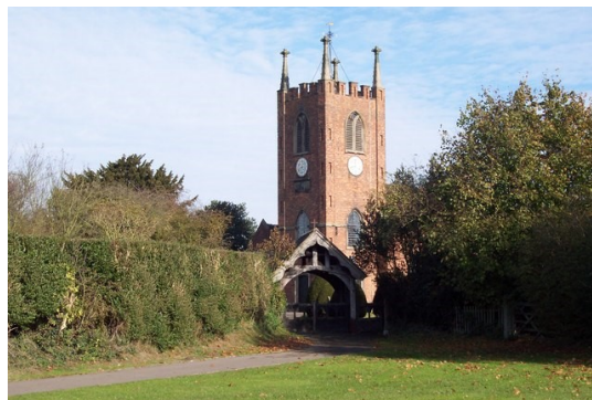
St. Chad's Church, Seighford, supporting local people in the community

My farming relatives in Shropshire have told me that the same thing is happening there.