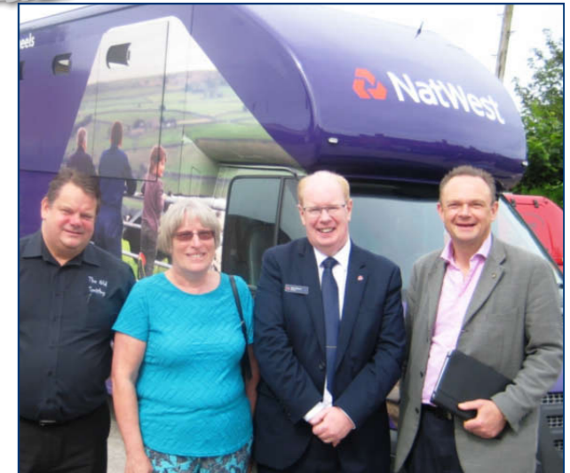
Launch of Nat West Mobile Bank in Eccleshall