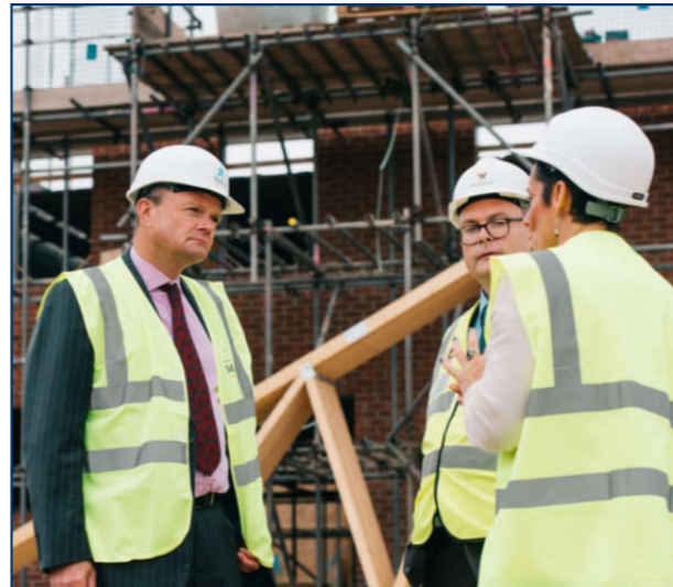
New housing development at The Westway

We all recognise that we've not built enough homes nationally for many decades. But ensuring we build the homes we need locally, of the right size and mix of tenures and affordability, community by community, has been a focus for the past few years. 200 new affordable homes have now been delivered