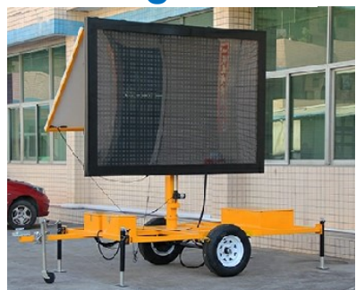
Highways England have placed mobile Vehicle Activated Speed signs outside Tittensor and in Trentham

A full motorway closure of Junction 13 and 14 of the M6 is planned for Saturday 23rd March at 20:00hrs to Sunday afternoon 24th March 2019 to remove an over-bridge.