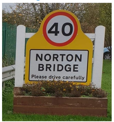
Norton Bridge's 40mph speed limit to be extended to create a buffer zone with a 30mph limit covering the village itself

This speed reduction has been argued for since 1948 and will make a sizeable improvement for local residents given the increased through traffic that the village has seen with recent developments.