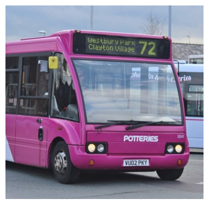
First Bus—Route 72a via Ferndown Drive and Clayton village has successfully increased full fare paying passenger numbers to a point where it is now viable