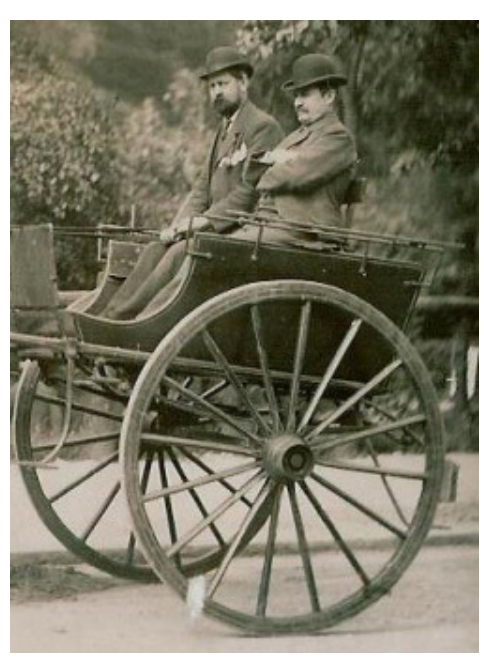
An example of the traditional trades being remembered in local street naming

Instead, following liaison between both the developers of the site and the Borough Council, sense has prevailed and instead Eccleshall Parish Council, in consultation with members of the Historical Society and community, has been able to put forward their ideas for suitable road names.