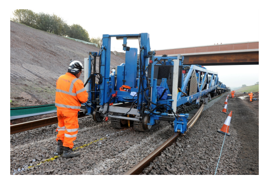
Specialist track laying equipment at Norton Bridge – as part of the laying of 10Km of new track

In addition a small number of ancient bottles have been retained in Stafford and it is hoped that these will be put on display at The Ancient High House so that these important finds can remain and be seen in the local area that they were unearthed in.