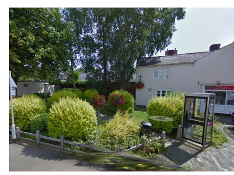
Eccleshall Toilet Area in Spring

The Eccleshall Toilet area has long been a dark and dank place in the centre of the town.