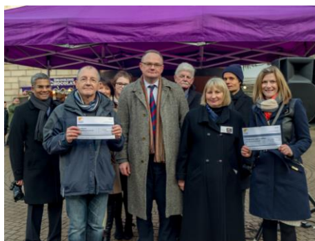
Presentation of Small Grants in Market Square, Stafford – Nov '17

Staffordshire has a long, proud, rich heritage in volunteering with a large diversity of groups available to individuals to benefit from, along with many people supporting the work of these groups through volunteering on a daily basis.