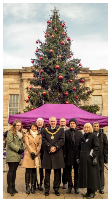
With the Mayor of Stafford, wishing everyone Seasons Greetings this Christmas-time

'Merry Christmas' and best wishes for a successful and prosperous New Year