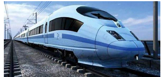
HS2 Ltd .Parliamentary Process

Therefore securing the best mitigation for the line is critical given it is likely to go ahead